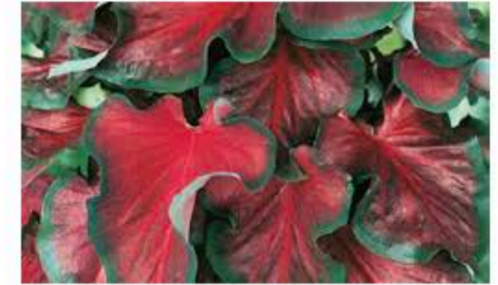
Red Ruffle - Red with green margins. Medium leaf that grows tall. Partial Sun-Shade.