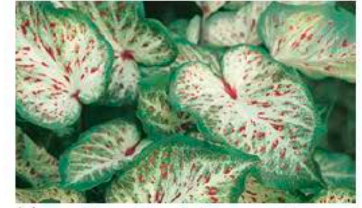
New Gingerland - Creamy white with white veins and many red spots with green margins. Slightly upright and bushy. Medium height, Sun