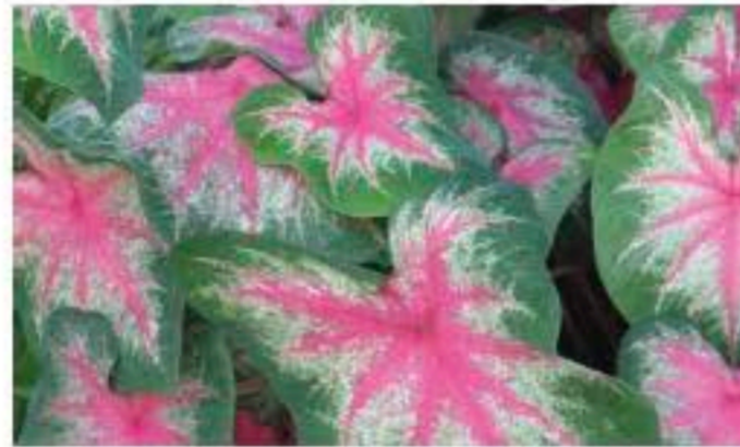
Rosebud - Medium sized leaves with dominant dark rose veins on frosty light green background with a dark green border. Shade to Full Sun.