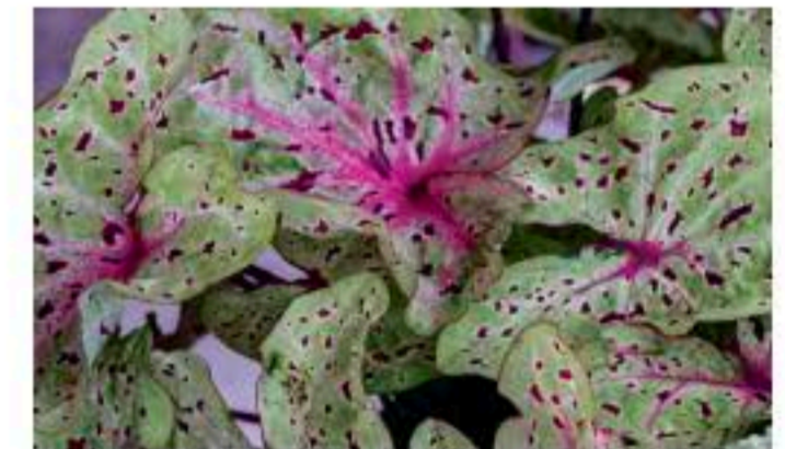
Miss Muffet - Chartreuse green with varying red and white veins, red spots. Compact, bushy, low grower, semi-shade.