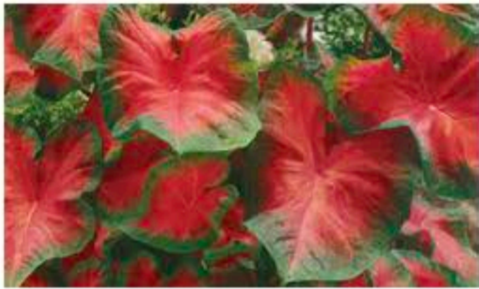
New Freida Hemple - Deep red with green margins. Prefers shade.