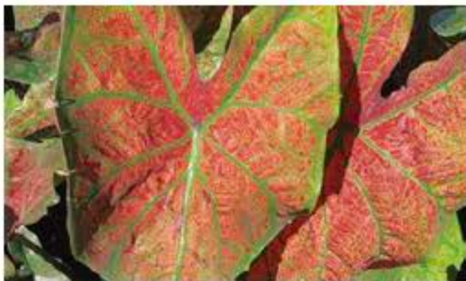
New Festiva - Red with green veins and green margins. Full sun - shade.