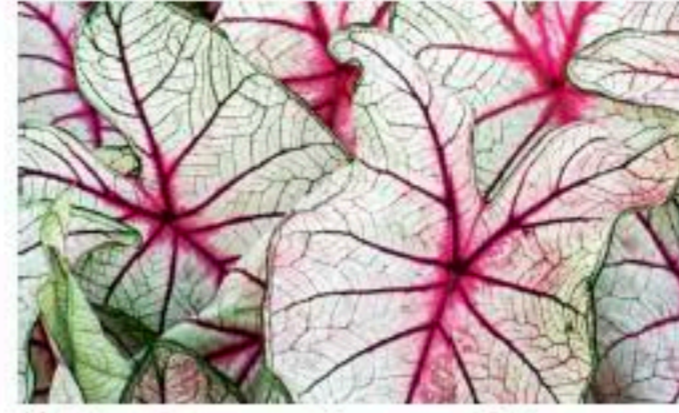
White Queen - Creamy white, green netted veins. Dark red central veins. Center can bleed to pink. Tall, large leaves. Sun tolerant.