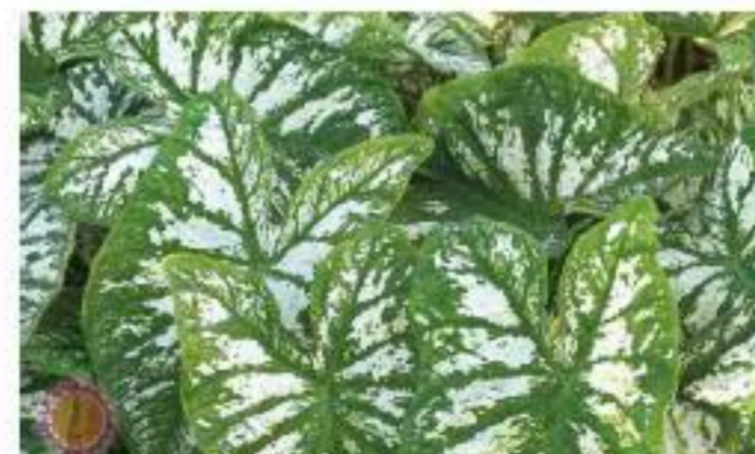
White Christmas - Very large leaves with dominant wide green veins on a white background. Tall with large upright leaves. Shade to Partial Shade.