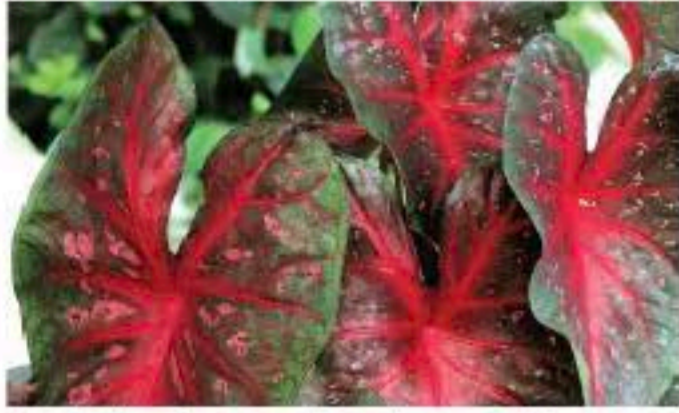
Red Flash - Dark red central veins with many pink spots and dark green margins. Tall, bushy, upright and does not like to be crowded. Full Sun.