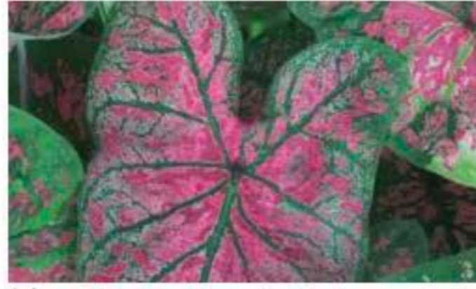
New Florida Roselight - Large pink blotches on green background. Medium-Large. Partial sun - shade.