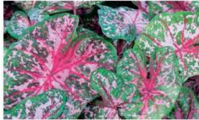
Carolyn Whorton - Medium toned pink blotches, red veins, green margins, large upright leaves, tall, sun tolerant.