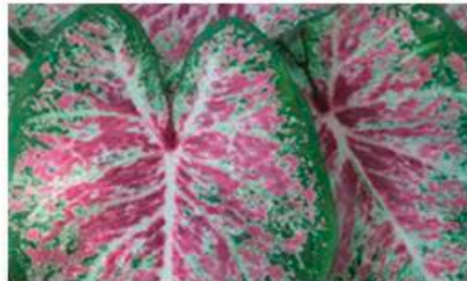
Pink Cloud - Pink with green margins. Tolerates some sun and has medium to large leaf. Sun-Shade.