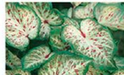
New Gingerland - Creamy white with white veins and many red spots with green margins. Slightly upright and bushy. Medium height, Sun