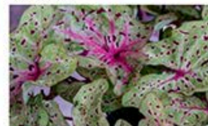
Miss Muffet - Chartreuse green with varying red and white veins, red spots. Compact, bushy, low grower, semi-shade.