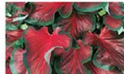
Red Ruffle - Red with green margins. Medium leaf that grows tall. Partial Sun-Shade.