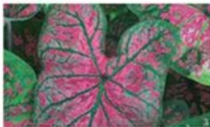
New Florida Roselight - Large pink blotches on green background. Medium-Large. Partial sun - shade.