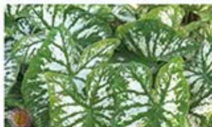
White Christmas - Very large leaves with dominant wide green veins on a white background. Tall with large upright leaves. Shade to Partial Shade.