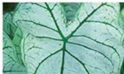
Candidum - Large white leaf with green veins. Grows 12-24". Partial Sun-Shade.