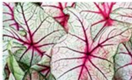
White Queen - Creamy white, green netted veins. Dark red central veins. Center can bleed to pink. Tall, large leaves. Sun tolerant.