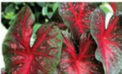
Red Flash - Dark red central veins with many pink spots and dark green margins. Tall, bushy, upright and does not like to be crowded. Full Sun.