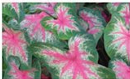
Rosebud - Medium sized leaves with dominant dark rose veins on frosty light green background with a dark green border. Shade to Full Sun.