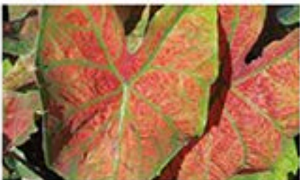
New Festiva - Red with green veins and green margins. Full sun - shade.