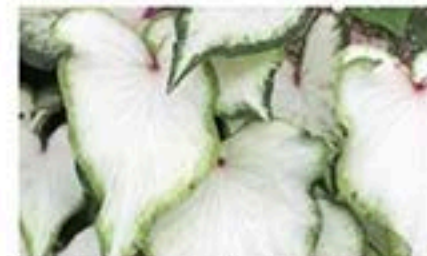
White Wing - Ruffled white leaves with very pale rose central veins and green mottled margin. Upright, very full. Shade to Full Sun.