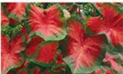
New Freida Hemple - Deep red with green margins. Prefers shade.