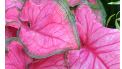
Florida Sweetheart - Mauve pink with green margins. Full Sun - Shade

If you are not buying caladiums this year, please consider a donation.