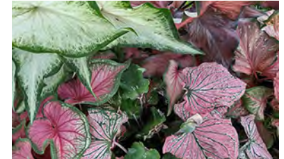
Mixed Variety - Splotchy pink with bright pink center and green border. Full Sun - Shade