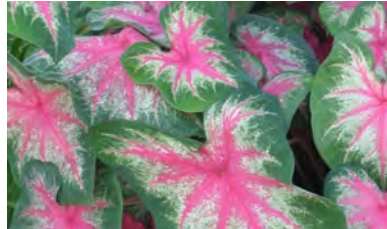
Rosebud - Medium sized leaves with dominant dark rose veins on frosty light green background with a dark green border. Shade to Full Sun.