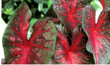
Red Flash - Dark red central veins with many pink spots and dark green margins. Tall, bushy, upright and does not like to be crowded. Full Sun.