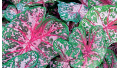
Carolyn Whorton - Medium toned pink blotches, red veins, green margins, large upright leaves, tall, sun tolerant.