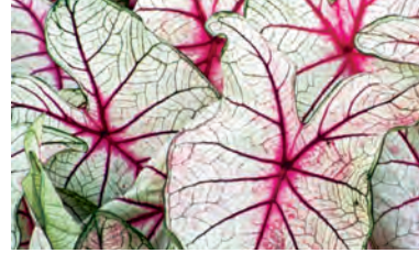
White Queen - Creamy white, green netted veins. Dark red central veins. Center can bleed to pink. Tall, large leaves. Sun tolerant.