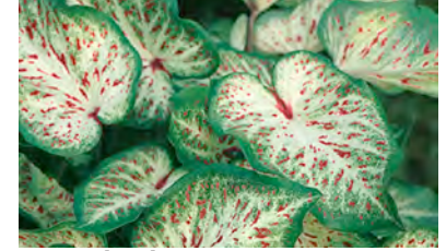
Gingerland - Creamy white with white veins and many red spots with green margins. Slightly upright and bushy. Medium height, Sun