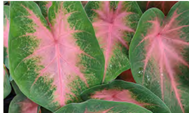
Kathleen - Pink with green margins. Partial Sun - Shade