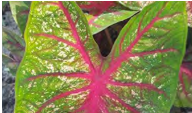
Florida Sunrise - Dark green leaves that are splashed with pink. Partial Sun - Shade