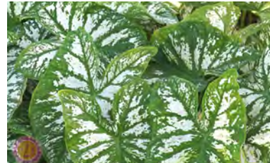
White Christmas - Very large leaves with dominant wide green veins on a white background. Tall with large upright leaves. Shade to Partial Shade.